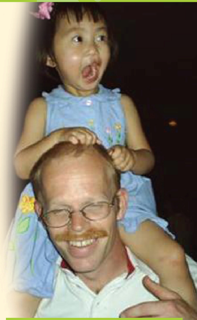
This little girl has microtia, atresia and a cleft lip and palate. She is a real joy to her family!