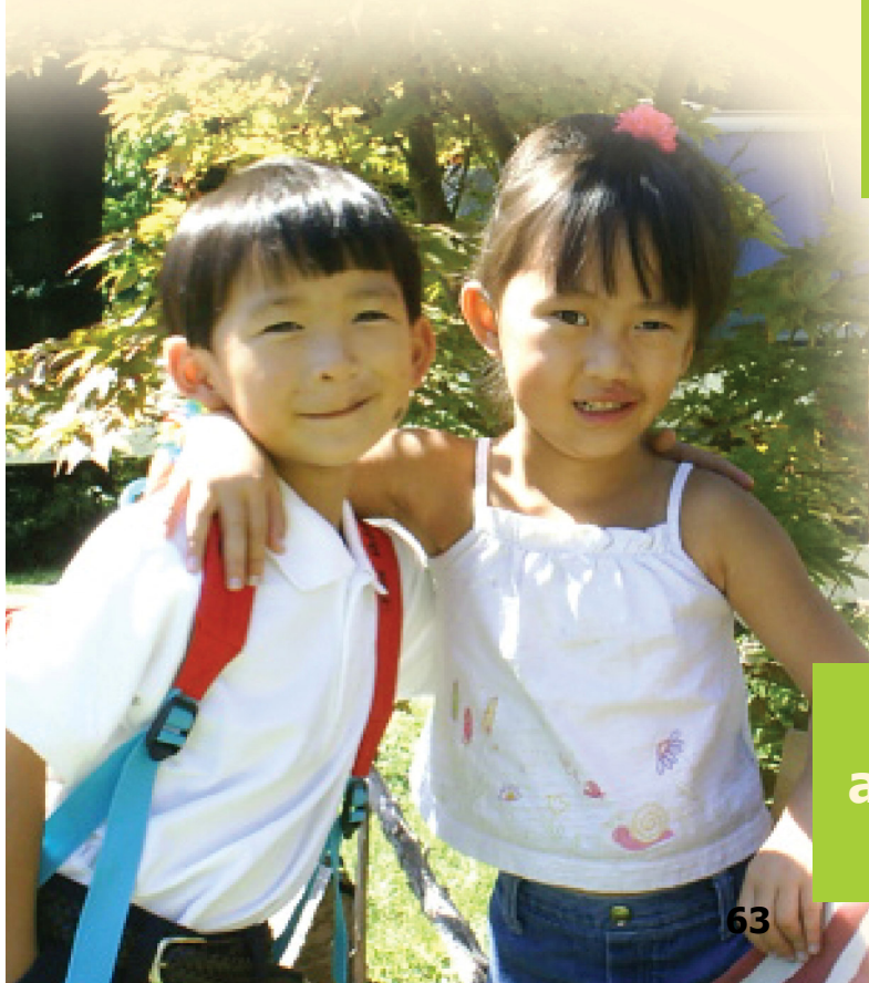
Children with microtia and atresia have normal intelligence.